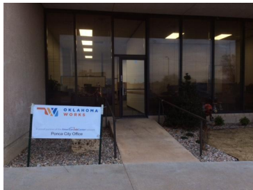
OESC Moves into City Central